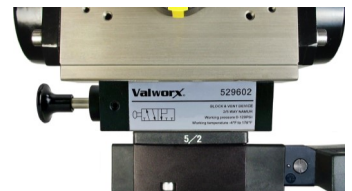
Block and Vent Valve– Stock #529602- Installed